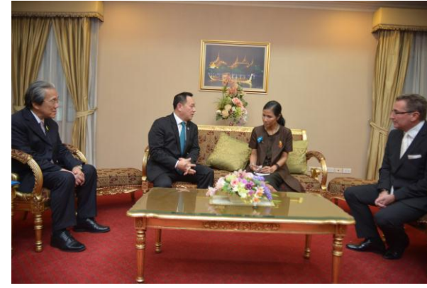
Minister of Minister of Tourism and Sports