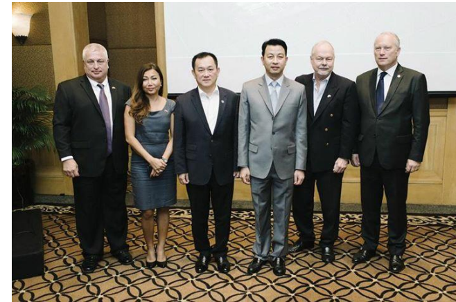
Breakfast Seminar on "Future Airport Infrastructure in Thailand" with President of Airports of Thailand (AOT)