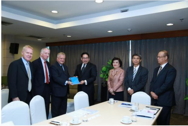
Minister of ICT