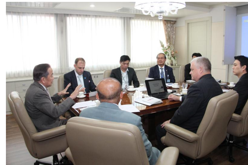
Courtesy Dialogue with Chairman, National Broadcasting and Telecommunications Commission ( NBTC )