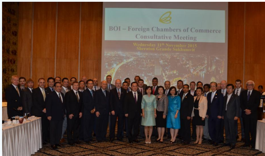
BOI – Foreign Chambers of Commerce Consultative Meeting