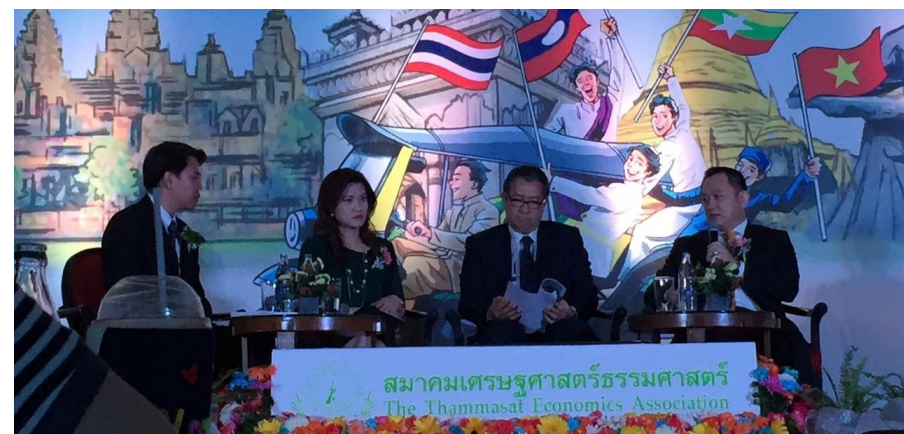
The Thammasat Economics Association