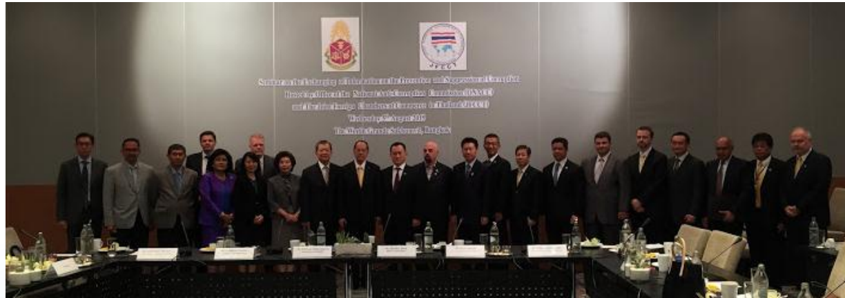
Seminar on the Exchanging of Information on the Prevention and Suppression of Corruption Hosted by NACC and JFCCT