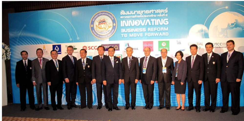
Thai Chamber of Commerce and Board of Trade of Thailand