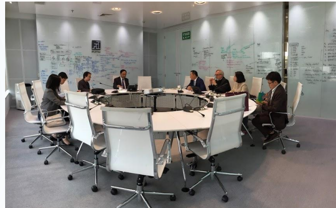
Minister of Science and Technology