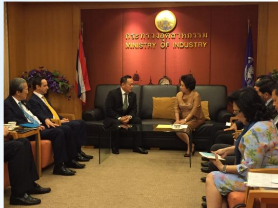
Minister of Industry