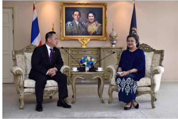
Minister of Commerce