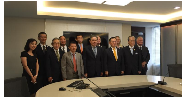
Minister of Finance