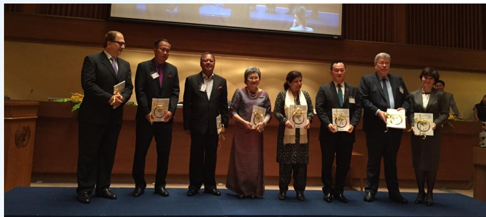
Public-private partnerships critical for inclusive and sustainable development, UN business forum